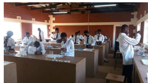
Computer Lab opened in 2017 and built by Build It International and furnished by Propel Education