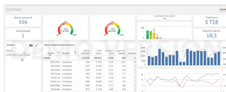
Summary for the month of November 2018

With the help of data analysis we could see a low attendance for grade 8 and 9 students. We believe this is due to longer regular school day and more duties in the home. We expect the students moving from grade 7 to 8 to continue attending the programme as they and their parents see its benefits. We will also take grade 4 students onto the programme and add literacy as an area of focus.