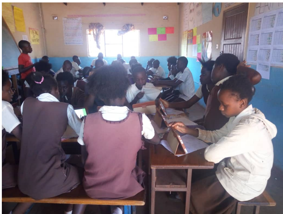
EDULUTION CLASS ROOM