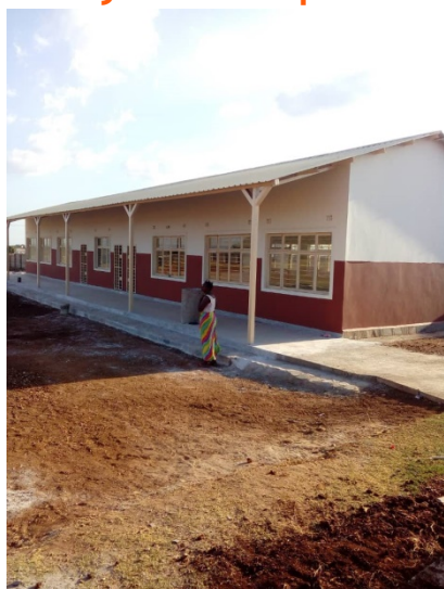
New classroom block – opened in October 2018

A block consisting of two new classrooms was built by Vision Zambia. The classrooms are to facilitate secondary schooling for Linda students graduating from grade 9. Linda community experiences a high dropout