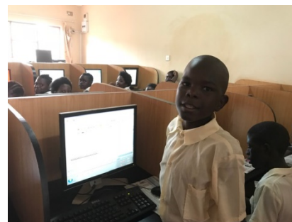
Computer Lab with 35 desktop computers. Funded by Propel Education