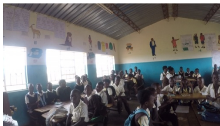
Painted class room for Grade 3 students